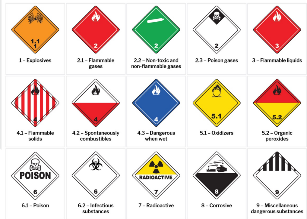
Overview of pictograms indicating hazardous substances